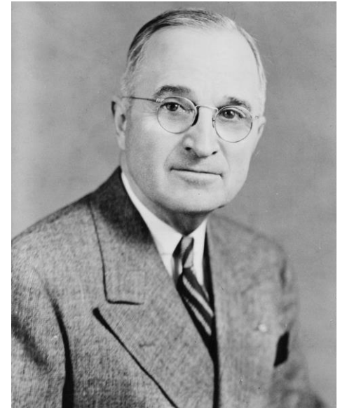
Harry S. Truman (1884- 1972)

The Truman Foundation was created in 1975 soon after President Harry S. Truman passed away. Instead of wanting a brick and mortar monument on the mall, President Truman wanted to support the next generation of public service leaders.